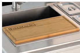
Removable Bamboo Cutting Board