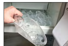
Ice Scoop Included