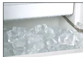
Stores up to 27 lbs of ice