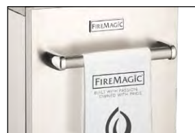
Horizontal handle that doubles as a towel bar (towel included)