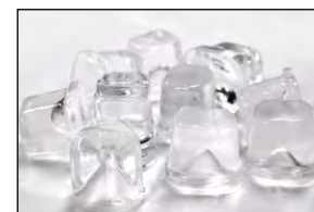
Produces clear, bell-shaped ice cubes