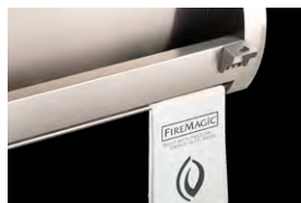
Towel Rack & Bottle Opener