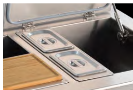
Removable Condiment Trays